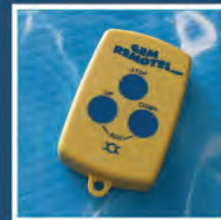
REMOTE CONTROL (ONE REMOTE INCLUDED IN ORDER)