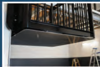
FULL UNDERSIDE PAN SWITCH